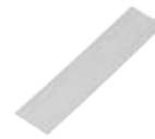
Ridge Batten Connector x10