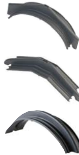
RussFast Ridge Union x10