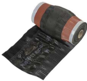
RussFast Ridge Roll 5m Ventilated or Unventilated